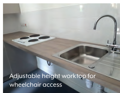
Adjustable height worktop for wheelchair access