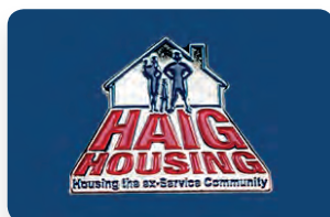
Pin Badge £2.50 including p&p