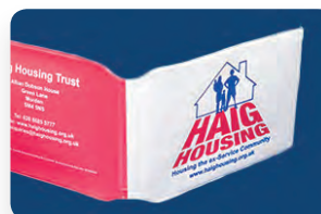
Oyster card holder £3 including p&p