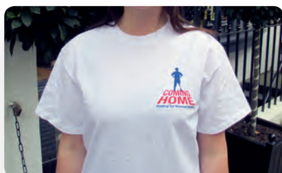
T-shirt in white (S, M, L or XL) £3 plus £2 p&p