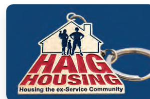
Key ring £3 including p&p