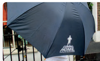
Umbrella Small £3, Large £5 plus £3.50 p&p