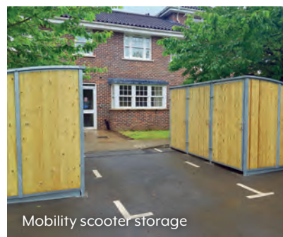
Mobility scooter storage

Forces Support is a sister charity to the Trust whose aims are, firstly, to provide relief and support to families of Service personnel killed on active duty and, secondly, for the relief of former Service personnel and their families who are suffering financial hardship. Their generous support has enabled Haig Housing to provide a level of additional enhancements that might not otherwise have been possible.