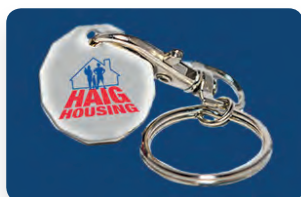
Trolley token £3 including p&p

Postage and packing costs are as indicated for each individual item. For multiple orders please email us at communications@haighousing.org.uk or telephone 020 8685 5786 and we can let you know what the combined postage cost will be.