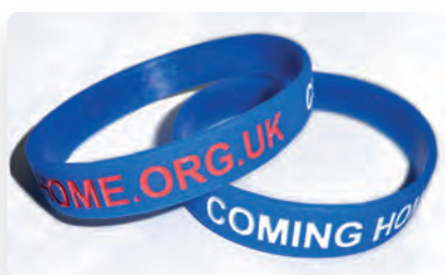
Wristband (adult or child) £1 including p&p