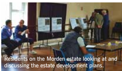
Residents on the Morden estate looking at and discussing the estate development plans.

Haig Housing Trust has secured funding for the construction of 76 new homes on our Morden estate from the Veterans Accommodation Fund. The new accommodation will enable us to: